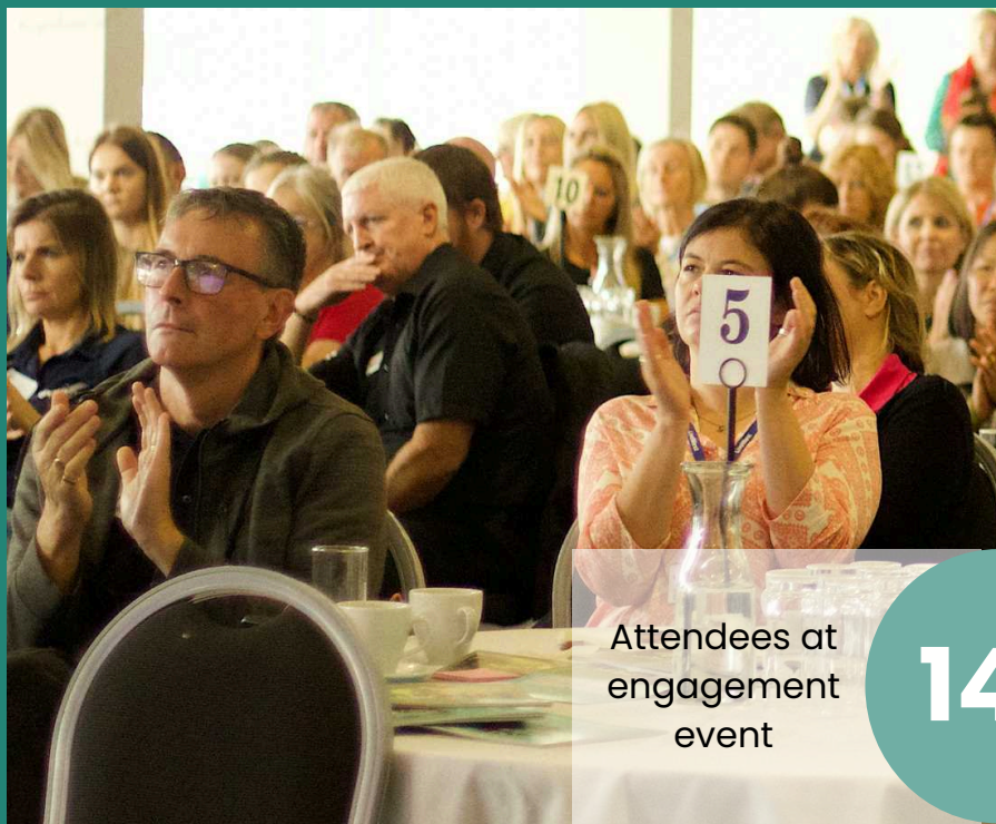
Attendees at engagement event

Workshops, seminars, events, Boards delivered & engaged with